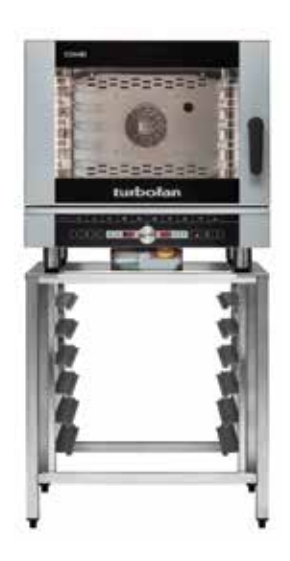
EC40D5 5 Tray Digital Electric Combi Oven

W 32 " x D 28% " x H 31%" W 812mm x D 725mm x H 795mm